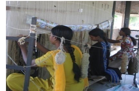
Carpet Weaving, collaboration with Jaipur Rugs Co. Pvt. Ltd.