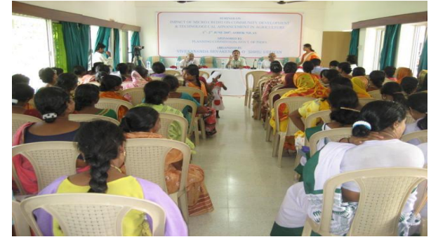
Business Dev training for SHGs