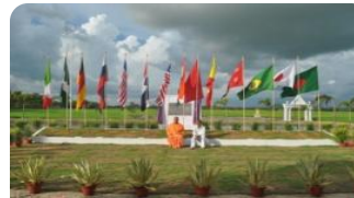
Intl. Brotherhood conference