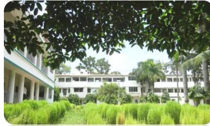
VIS CBSE SCHOOL