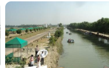
Rural Tourism & Cultural Centre