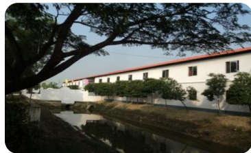
Skill Training campus

Inviting Collaboration for programmes like poverty Alleviation, Women empowerment , Skill training & Education for all , Health, sustainable Environment etc. ..