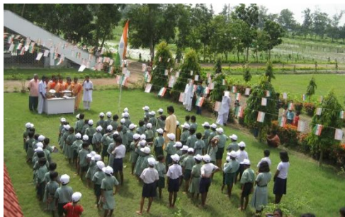
Home for Destitute Children