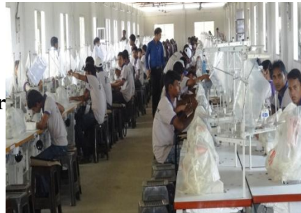
Residential Skill Training center for 4000+ trainees