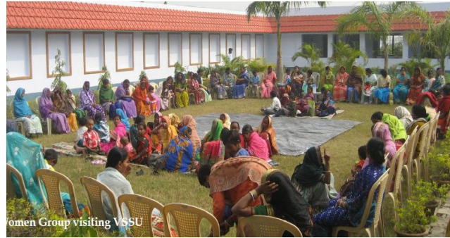
Women of Self-Help Group visiting VSSU