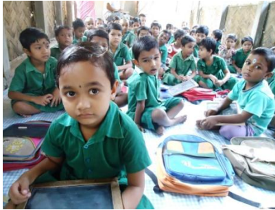
Crèche & Preprimary school Programme