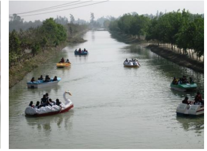
Great men Gallery & water amusement