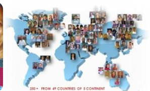
Interns & expositors