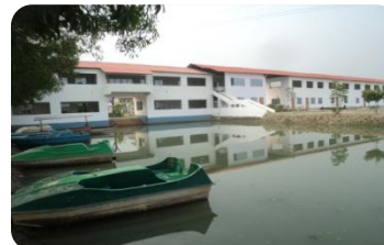
Residential Campus ( #700)