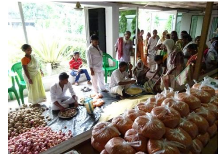
Distribution of Rice & pulse