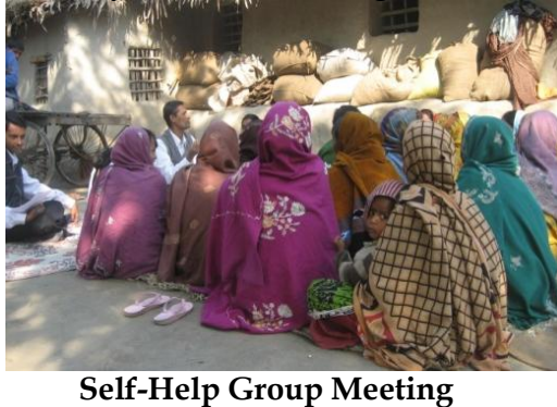
Self-Help Group Meeting