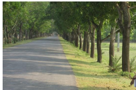
140 km PWD & Village Roadside #10,00,000 Tree Plantation