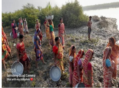
Mangrove Plantation & Conservation for Sunderban