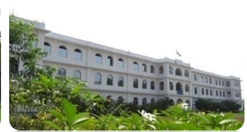
ANNCE B.ED. COLLEGE

VSSU is a social developmental organization working since 1986 in 910 villages of 10 blocks of South 24 pgs adjacent to coastal Sunderban with 175600+ direct beneficiaries & 151 dedicated staffs . In 2011 VSSU has been awarded “Special Consultative Status’ by United Nation (ECOSOC) “to support the holistic Development of the Indian community in self Sustainable manner in particular through Micro Finance program with various community development programs’ viz. Crèche Schools, B.ED College , Polytechnic Colleges, Library, PMKK & DDUGKY Skill training center, Health center, Social forestry & Mangrove plantation & conservations progs etc.