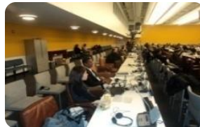
UNITED NATIONS PROG