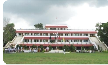
JNV School ( CBSE) MOHRD