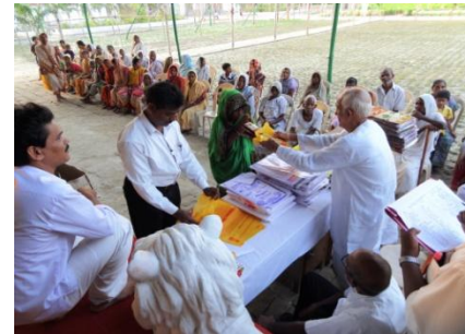
Old age relief programmes