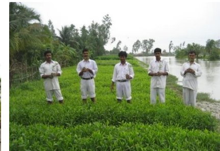
Organic Farming & Nursery