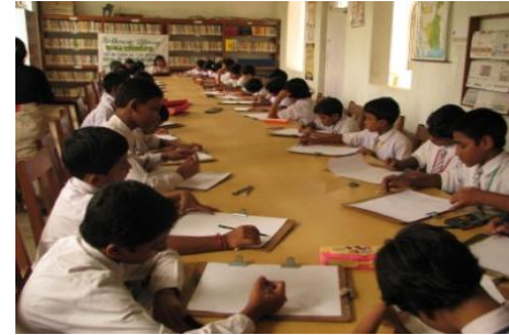
Community Library & VIS School