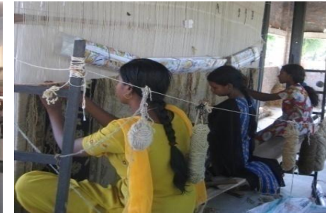
Carpet Weaving, collaboration with Jaipur Rugs Co. Pvt. Ltd.