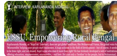
Press release of UN