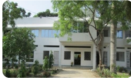
INTERNATIONAL SCHOOL (Secondary).