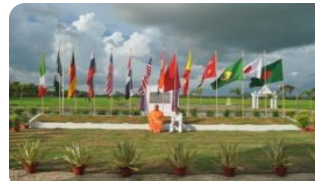
Intl. Brotherhood conference