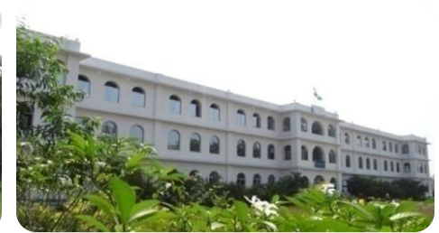
A N NIVEDITA B.ED. COLLEGE

VSSU is a social developmental organization working since 1986 in 510 villages of 10 blocks of South 24 pgs adjacent to coastal Sunderban with 126,600+ direct members & 149 dedicated staffs . In 2011 VSSU has been awarded “Special Consultative Status” by United Nation (ECOSOC) “to support the holistic Development of the Indian community in self Sustainable manner in particular through Micro Finance program with various community development programs’ such as School , College, Library, Skill training center, Health center, renewable energy , Social forestry prog , Agri based - Rural tourism & Cultural center etc..’, and we have achieved all these without any external grant/fund support..