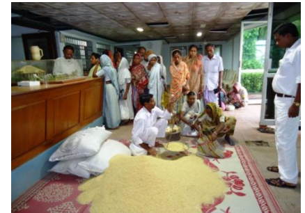
Distribution of Rice & pulse