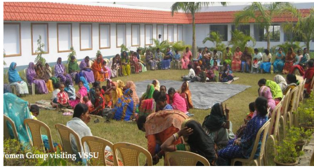
Women of Self-Help Group visiting VSSU