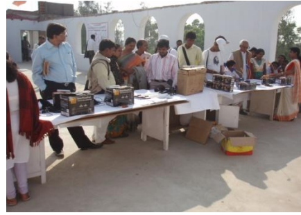
Renewable Energy Centre