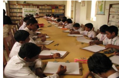
Community Library & VIS School