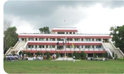
JNV Vidyalaya (H.S) GOI