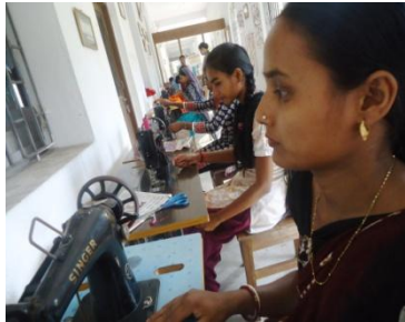
Skill Training prog for Women