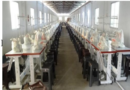
Residential Skill Training center for 4000+ trainees