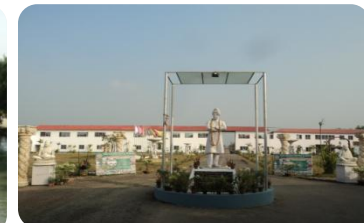
Industrial Training- DDU-GKY