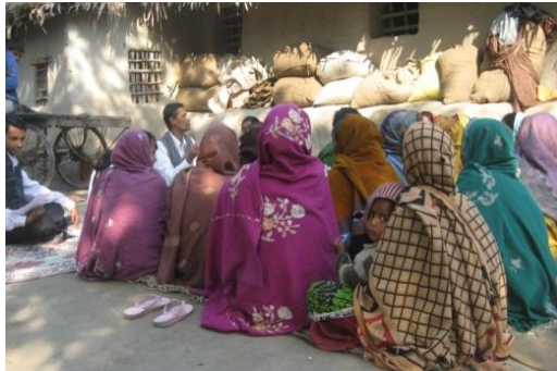
Self-Help Group Meeting