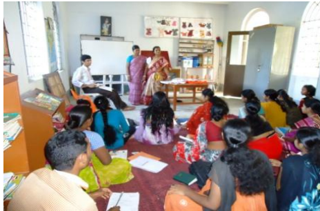
Tailoring training & Computer training