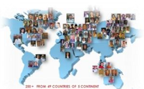
Interns & exposers