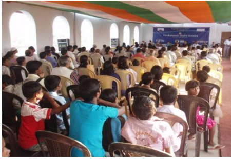
Vivekananda Shakti Kendra