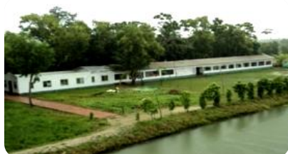
Destitute children Home- 2008