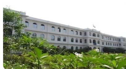
THE OCEANIC LIBRARY for Education, Livelihood promotion Training & Skill Development