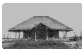
VSSU at inception 1986

Poverty alleviation & Social dev. through Micro Finance