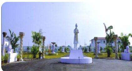
VSSU ITC (Rural Tourism Park) -2012