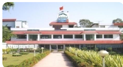
VSSU MICRO-FINANCE H Q For Economic Development Small Savings, Credit, Insurance