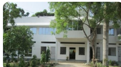
VSSU International School -2013

VSSU, the mother concern of The Oceanic Library, an organization for social development working since 1986 for the poorest for several dev programmes like Micro credit for Women empowerment, Educational (crèche, Primary & Secondary education) & Social dev, Social Forestry prog, Heath Hygiene & Sanitation programme, Skill dev Training & rural Tourism Programme for resource mobilization and job creation without any external fund support in a self sustainable Manner. Presently VSSU is working with 1,19,000 + families* in 510 villages of 10 Blocks of coastal Sunder ban Area with 125+ dedicated employees. VSSU have been accredited with Special Consultative Status by UN ECOSOC in Aug-2011 to support the community in a self sustainable Manner.